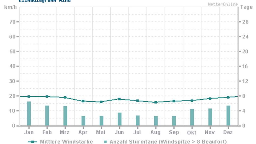
Wetterstation Rostock-Warnemünde (10m) Klinadiagramm Wind